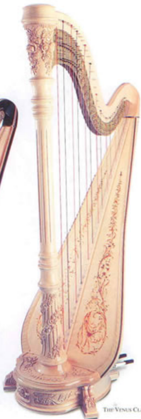
THE VENUS CLASSIC