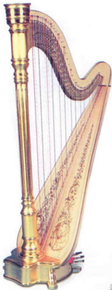
THE VENUS CADENZA