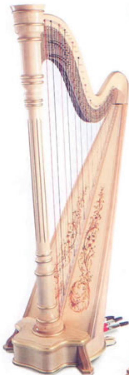
THE VENUS LEGEND