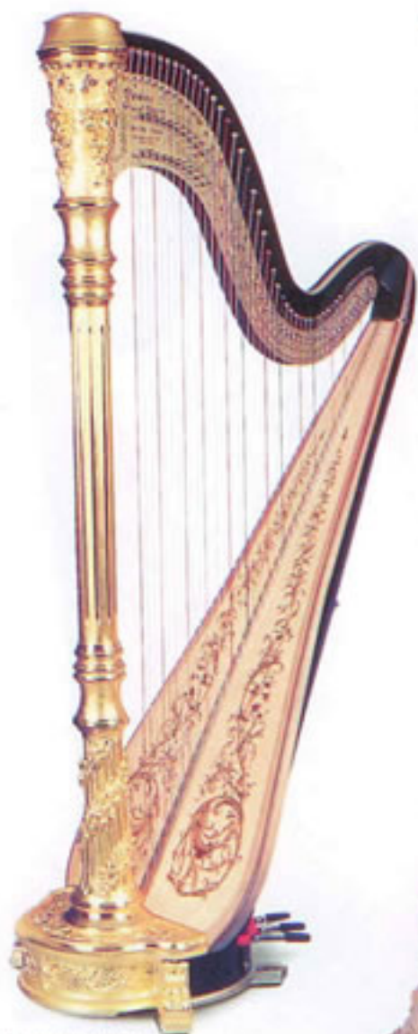
THE VENUS AQUILAN