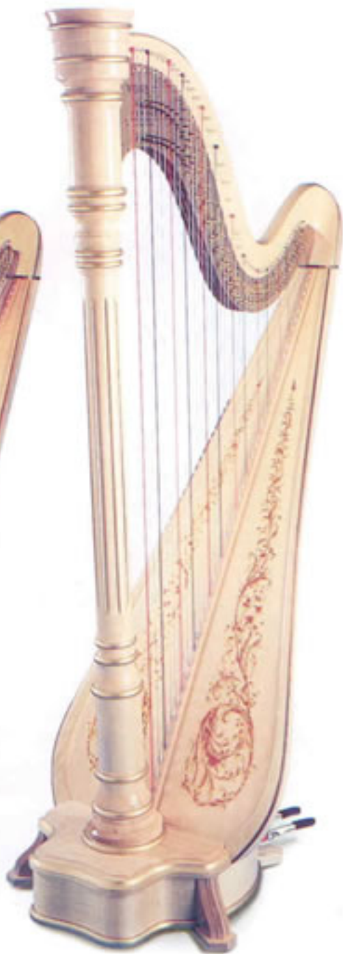
THE VENUS ENCORE