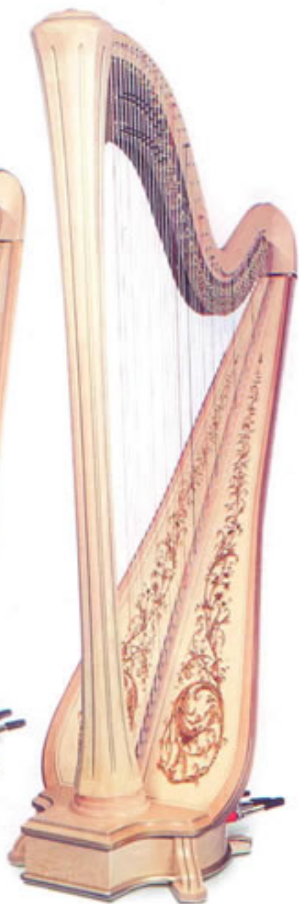
THE VENUS PREMIER