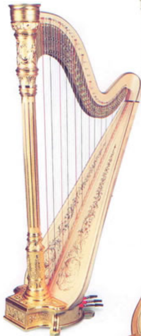
THE VENUS ANGELUS