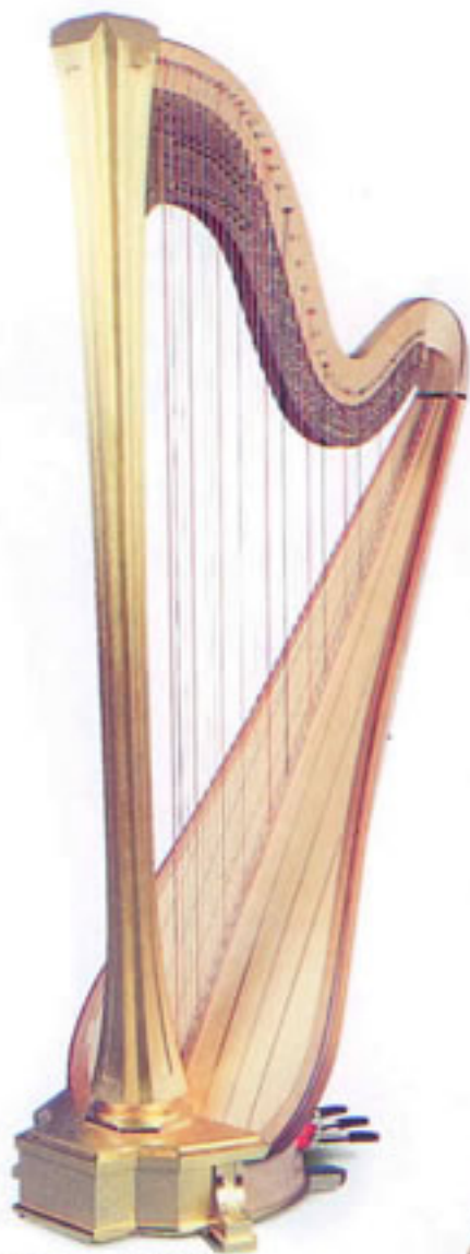
THE VENUS CENTURION