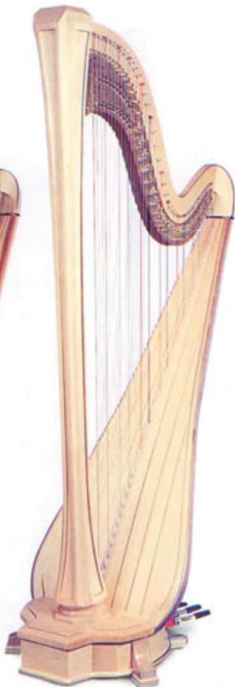
THE VENUS CRITERION