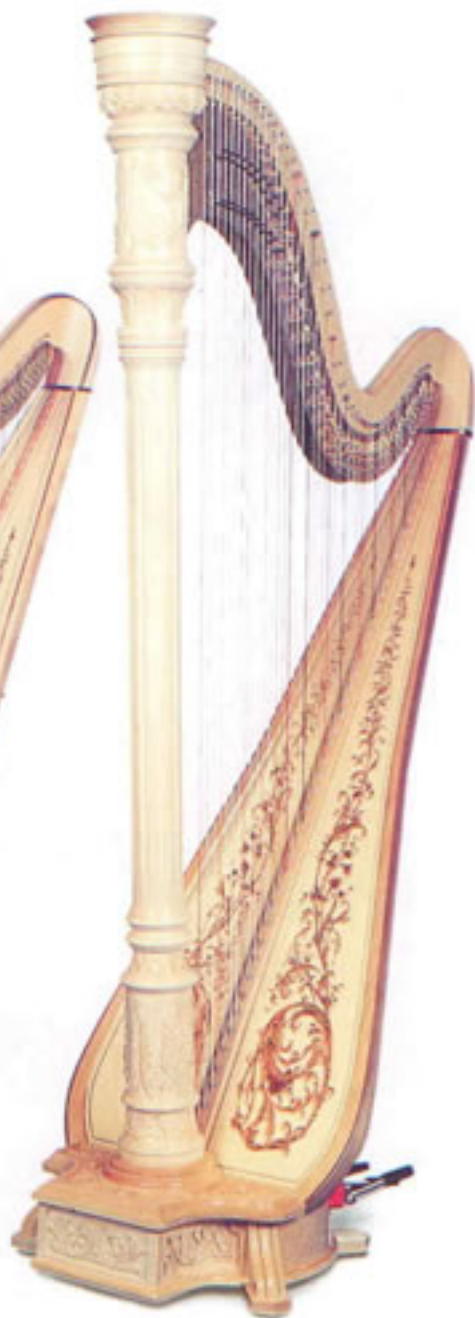
THE VENUS TRADITIONAL