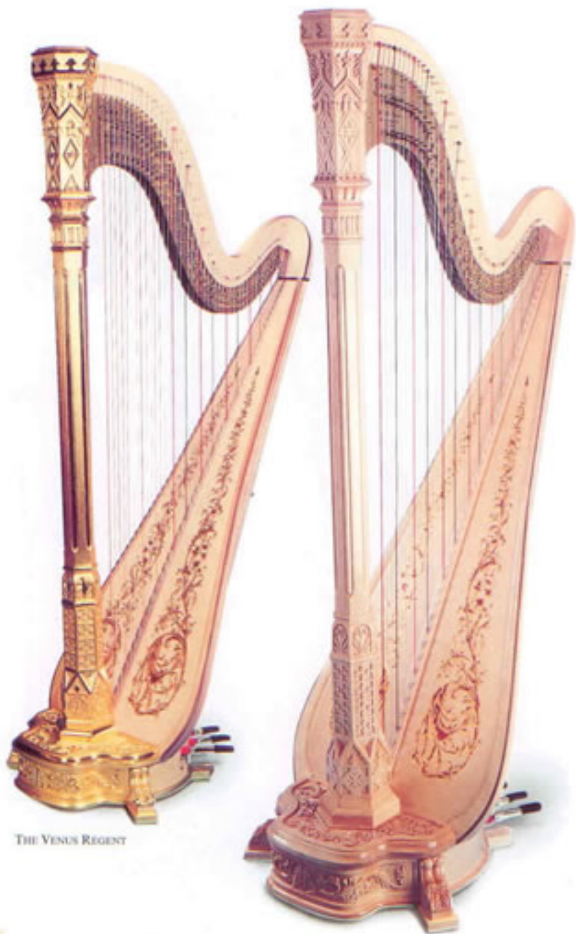
THE VENUS REGENT